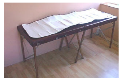
Aura Cleanser Screen Open Code 5320 cost £22.50

has a special connection to it with a lead and crocodile clip. This makes it easy to connect up to your Aura Cleanser. We would suggest you put a couple of folded blankets on it to suppress any noise the film makes and stop it getting too hot and sweaty. For the therapists who treat people in clinic, the blanket is comfortable to lay on and can be folded easily and is very portable.