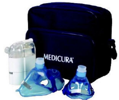
Nebuliser Code 5163 Cost: £65

We are now supplying portaneb as seen in this photograph.