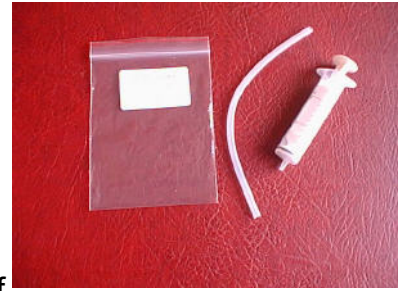
Rectal Delivery kit Code 6020 £2.75

When my wife got a bad cold recently I thought this might be an opportunity to test Colloidal silver. So I began taking Silver (5-10ppm) both by rectum (20-30ml) and by nebuliser inhalation (2ml) twice a day. In spite of this, after 4 days I began to develop the cold. I continued the treatment for the next 6 days, but without obviously aborting it - in terms of time. However, judging by the completely colourless nature of the mucus, and the lack of soreness - either in throat or lungs, I would suggest that it did inhibit the secondaries.